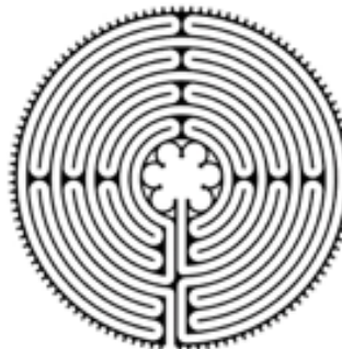
Chartres Medieval Labyrinth