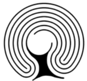
Baltic Wheel Labyrinth