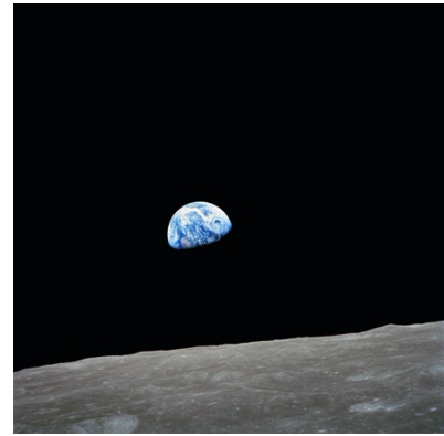
Earthrise Link to Image

“Walk as One at 1” in the afternoon to create a wave of peaceful energy around our planet as it turns in space.